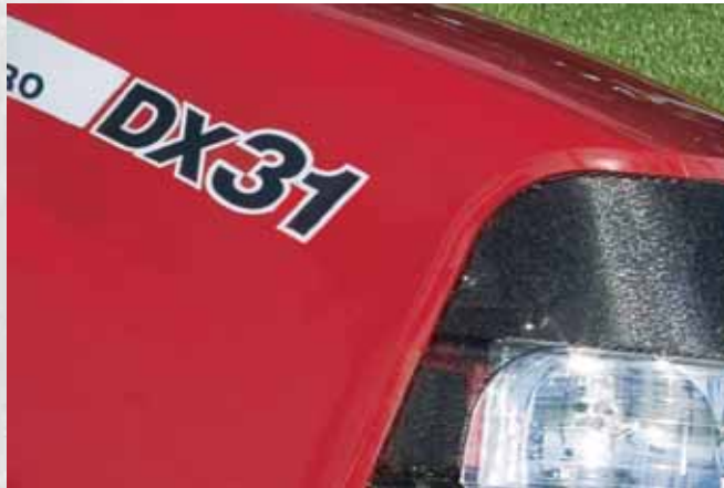
Case IH simplified the naming system for DX Series tractor models. The number in the name is the model's rated engine horsepower.

Case IH DX40 and DX45 FARMALL compact tractors are available with a factory-installed cab, making you productive and comfortable in any environment. From sunny-day mowing to dusty leaf blowing and windy-weather snow-blowing, these multi-tasking machines keep you dry and comfortable so you can finish chores in a hurry. The Farmall cab features two wide-opening doors, a rear opening window and high-visibility roof panel for outstanding visibility. Other standard features include heat, air conditioning, a deluxe cloth covered seat, front windshield wiper and washer, worklights to both front and rear, and much more.