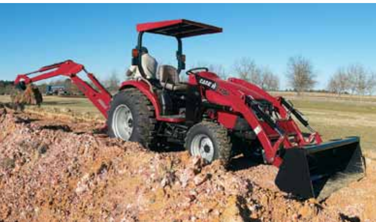
Attach the optional BHX1114 backhoe that can be mounted on the tractor along with a loader or front blade.

No matter which model and available attachments you put through the paces, every one of these tough tractors and integrated implements can handle all-purpose projects with greater productivity.