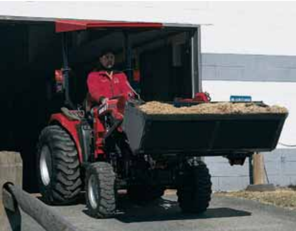
DX34 with FOPS canopy and LX340 loader

Maneuverable enough for manure handling chores inside buildings, an agile DX Series tractor lets you get through gates and down barn aisles. A foldable ROPS temporarily lowers clearance requirements. The optional FOPS canopy offers an added level of operator protection when lifting bales and other loads.