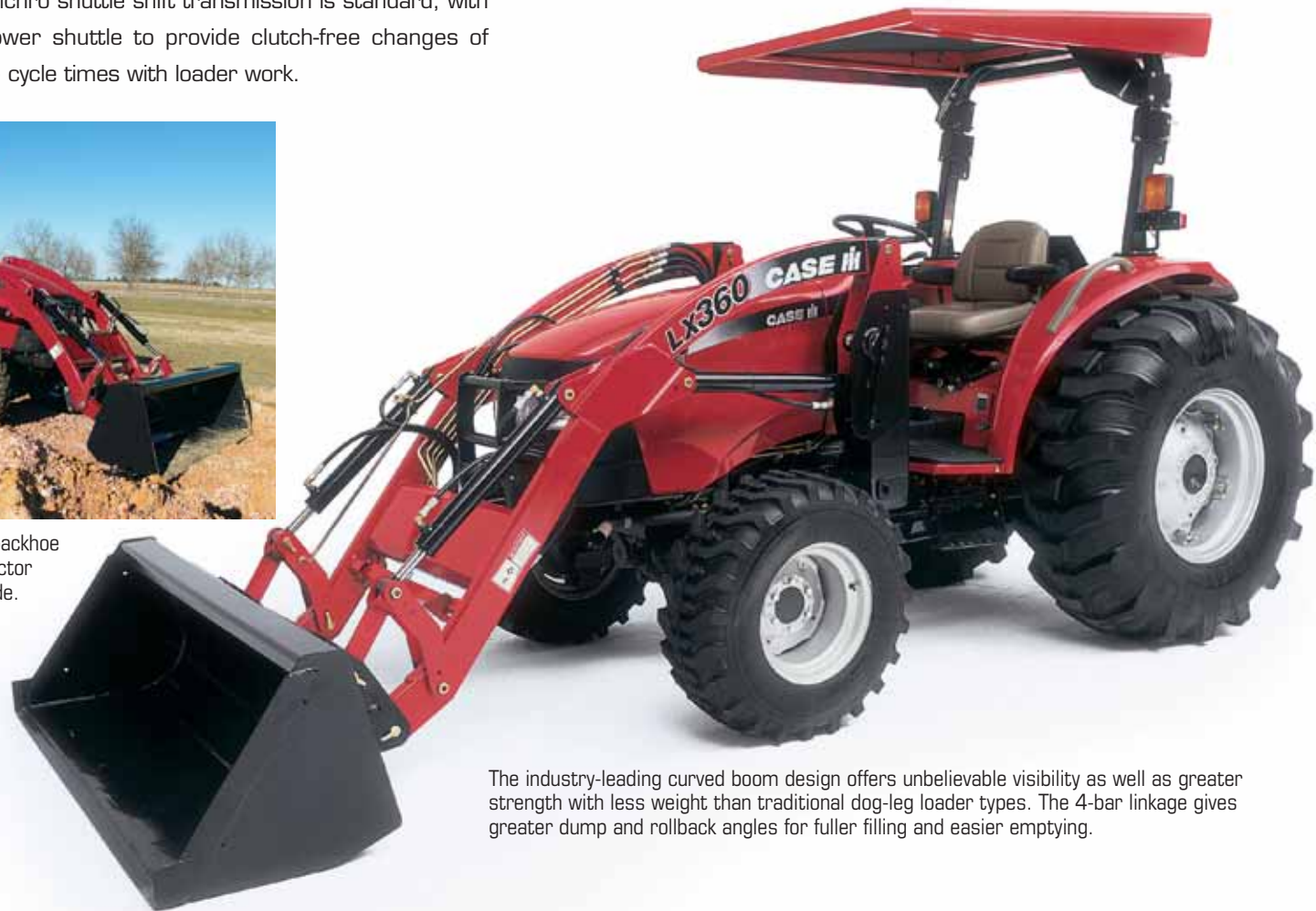
The industry-leading curved boom design offers unbelievable visibility as well as greater strength with less weight than traditional dog-leg loader types. The 4-bar linkage gives greater dump and rollback angles for fuller filling and easier emptying.