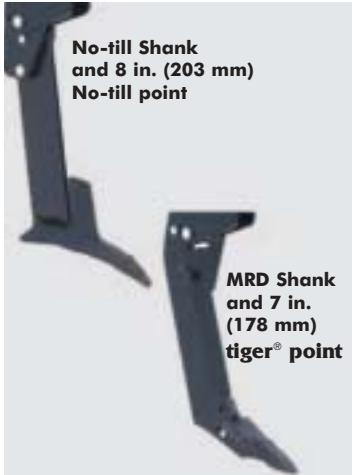
No-till Shank and 8 in. (203 mm) No-till point

The 2500 Rip-Strip offers two shank options to meet the surface and sub surface soil fracturing requirements of most rip-strip farming operations. Select the No-till shank when uniform soil flow is required and the Minimum Residue Disturbance (MRD) shank for greater soil fracturing and maximum soil movement.